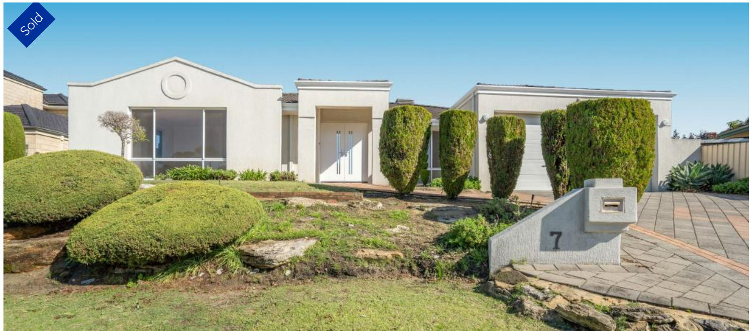
7 Trailridge Turn, Leeming